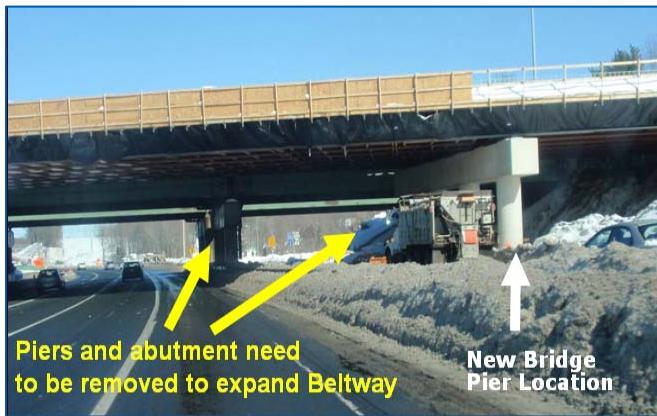
Piers and abutment need to be removed to expand Beltway